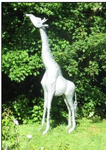
Photo: It's amazing what was seen during the recent Walking Festival in Llantwit Major!

In April we took part in Clean Coast Week cleaning beaches at Sully and, for the second year, Nash Point. It was interesting to find that there was less litter on the beach at Nash this year compared to last, so a good result.