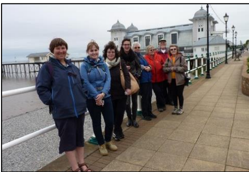
Photo: Walkers on the Penarth Scenic Walk enjoying a well-earned rest and taking in the stunning views!

The Seventh Walking Festival was again a resounding success. Almost 300 walkers defied the rain to join a variety of walks around the Vale. Many a themed walk proved very popular. Two walks also gave walkers the opportunity to combine a walk with a musical event as part of the Vale of Glamorgan Music Festival.