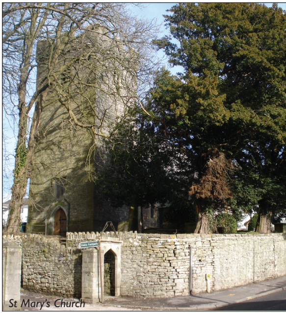
St Mary's Church