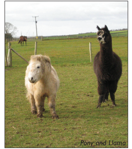
Pony and Llama

Turn left and proceed gently uphill, passing the entrance to Ty'n y Coed Farm, till you reach a gate on the right. Go through and then bear slightly left, across a small valley, aiming for a waymarked gate on the far side. Once through this head just left of a pylon to a gap in the far right hand field corner. Now swing left to a stile in the hedgerow and cross a narrow field to another stile and sleeper bridge. Continue in the same direction passing under a line of telephone wires to a stile in the far right hand corner. Turn right here and walk on, with a hedge on your left, to a stile. Turn left and head straight on to the stile on the far side of the next field. Finally follow the often nettled path to the main A 48 road. Cross it to the starting point.