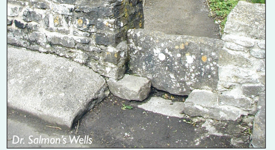
raph © Vale of Glamorgan Counc

Registered Charity No. 1062031 Registered Company No. 3330088