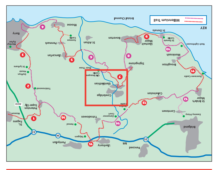
WALK LOCATION IN RELATION TO VALEWAYS' MILLENNIUM HERITAGE TRAIL

Valeways' Millennium Heritage Trail covers a distance of over 100km, spanning over 6,000 years of history. It wends its way through a variety of beautiful landscapes. At its northern edge there are panoramic vistas of the Blaenau Morgannwg, while in the south it skirts a spectacular cliffed coastline.