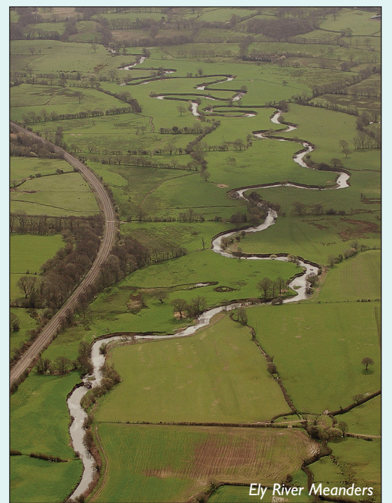
Ely River Meanders

Distance: Whole walk 7 miles, northern loop 4 miles, southern loop 3 miles.