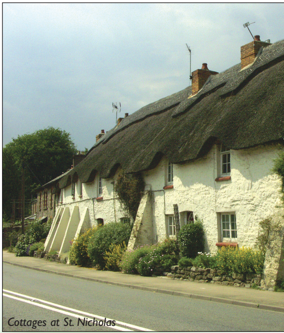
Cottages at St. Nicholas