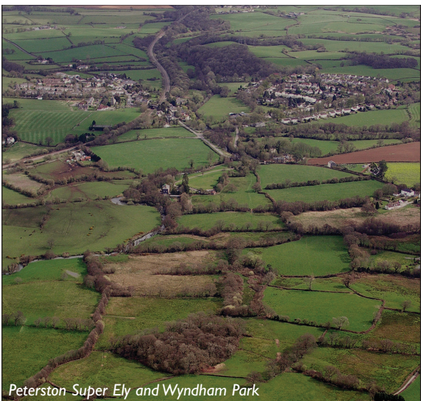
Peterston Super Ely and Wyndham Park