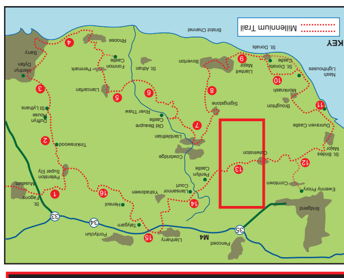
VALEWAYS' MILLENNIUM HERITAGE TRAIL WALK LOCATION IN RELATION TO

in the south it skirts a spectacular cliffed coastline. there are panoramic vistas of the Blaenau Morgannwg, while through a variety of beautiful landscapes. At its northern edge 100km, spanning over 6,000 years of history. It wends its way Valeways' Millennium Heritage Trail covers a distance of over