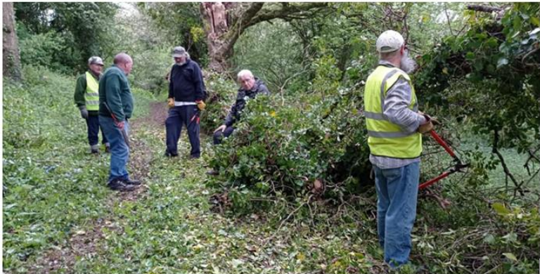
Clearing the green lane around the transmitter site and cutting back a fallen tree in Coed Nant Bran

It made my day walking puppy down the green lane and NOT stinging my knees! It's nice and safe to walk her off lead there as she's only young. THANK YOU!!