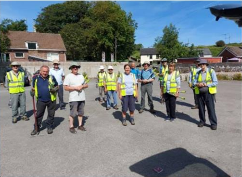
That looks like a Great job, we walked that way recently and got stung to bits by the nettles. Thanks to all concerned.