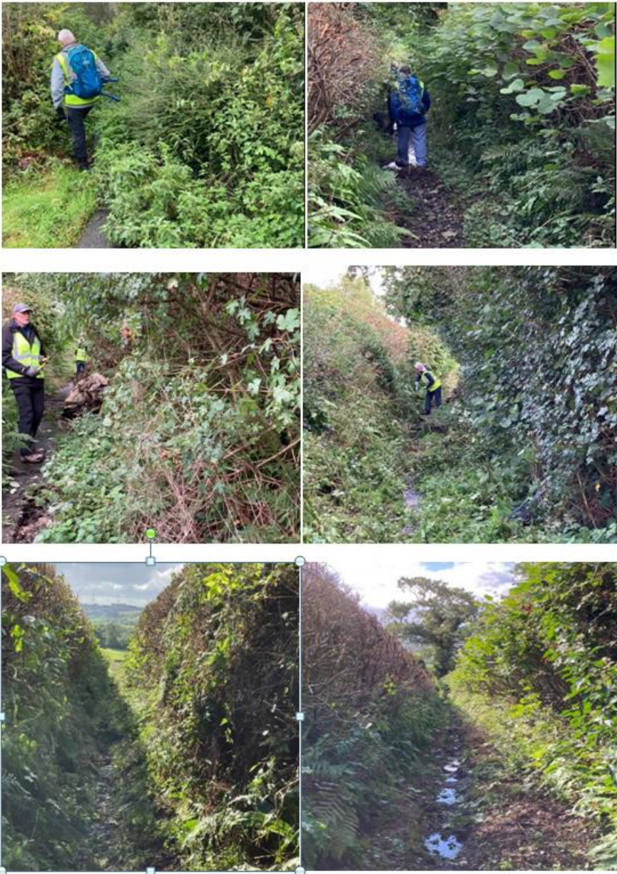
Fantastic - it's been impassable down there for months!

Thanks for that. It's become impossible to walk up to the village in the last year or so.