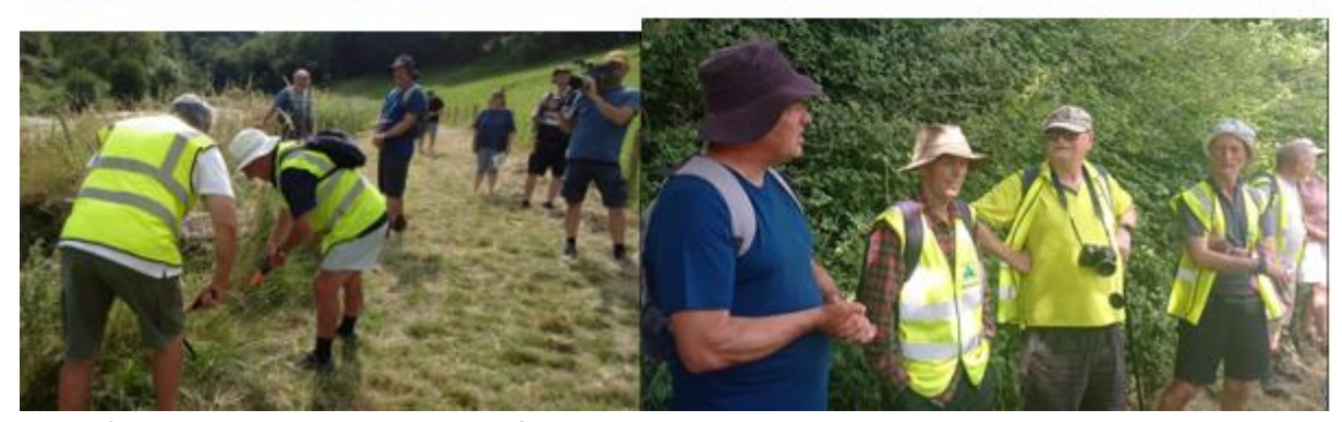
12 July 2022 – Watery Lane, Llantwit Major