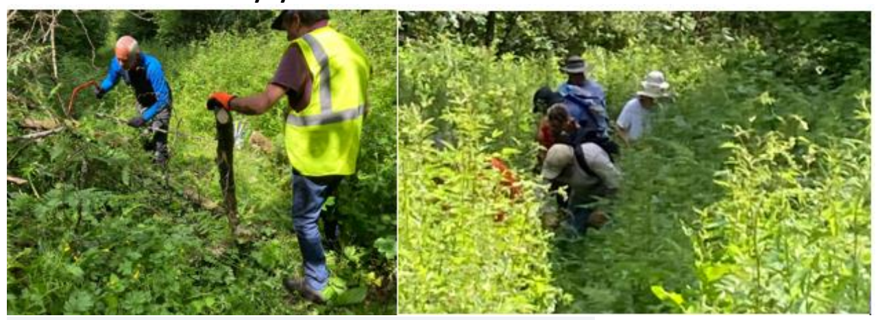
Thank you - we struggled to walk up that path a few weeks ago