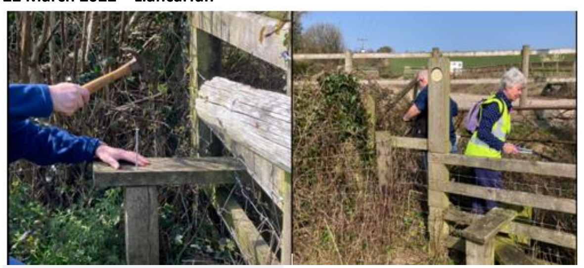
Many Thanks from an appreciative walker.