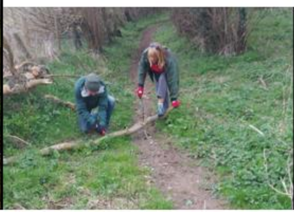
5 April 2022 – Tresillian Bay