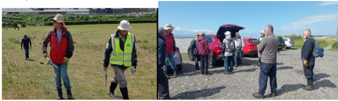
7 June 2022 - Ogmore Castle