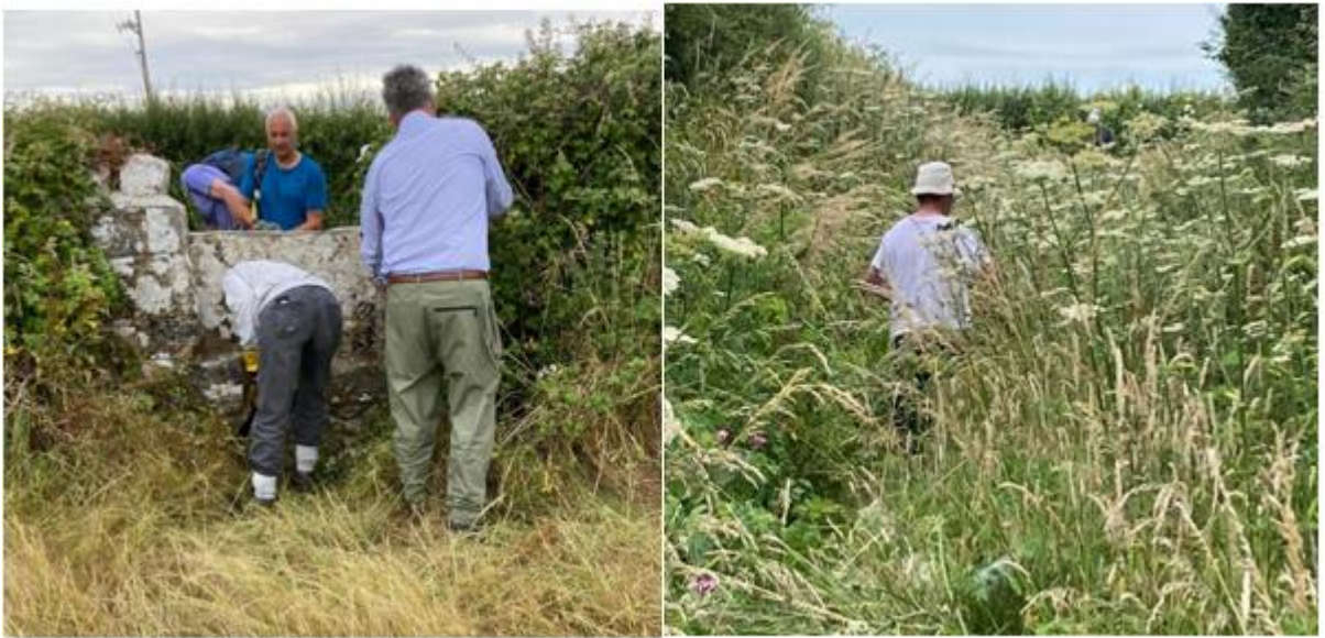
A big shout out to Valeways, well done! I went out there this afternoon to do some clearing, however, you'd beaten me to it!