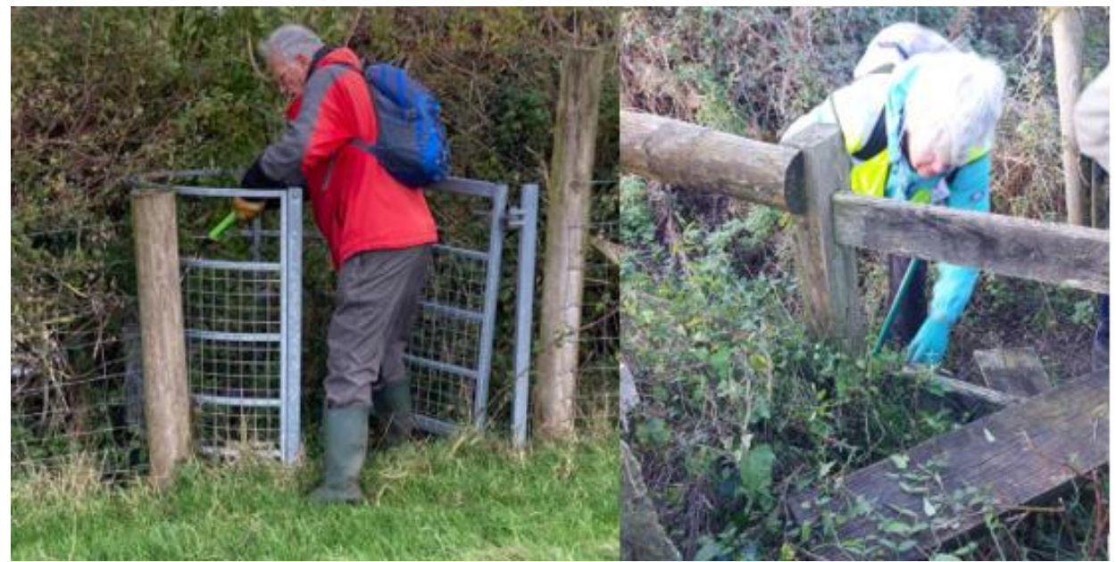
Well done folks!! Everything is an uphill struggle with a lack of resources and Volunteers.