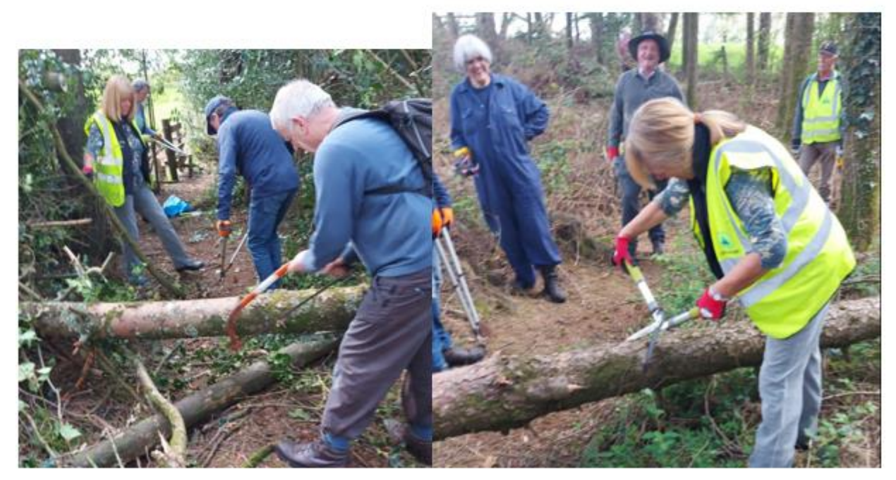
26 April 2022 – St Brides Major