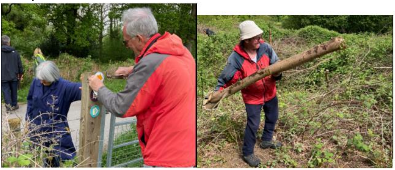
What a mammoth task u all had. Well done for keeping our secret footpaths clear x 17 May 2022 – Llanmaes