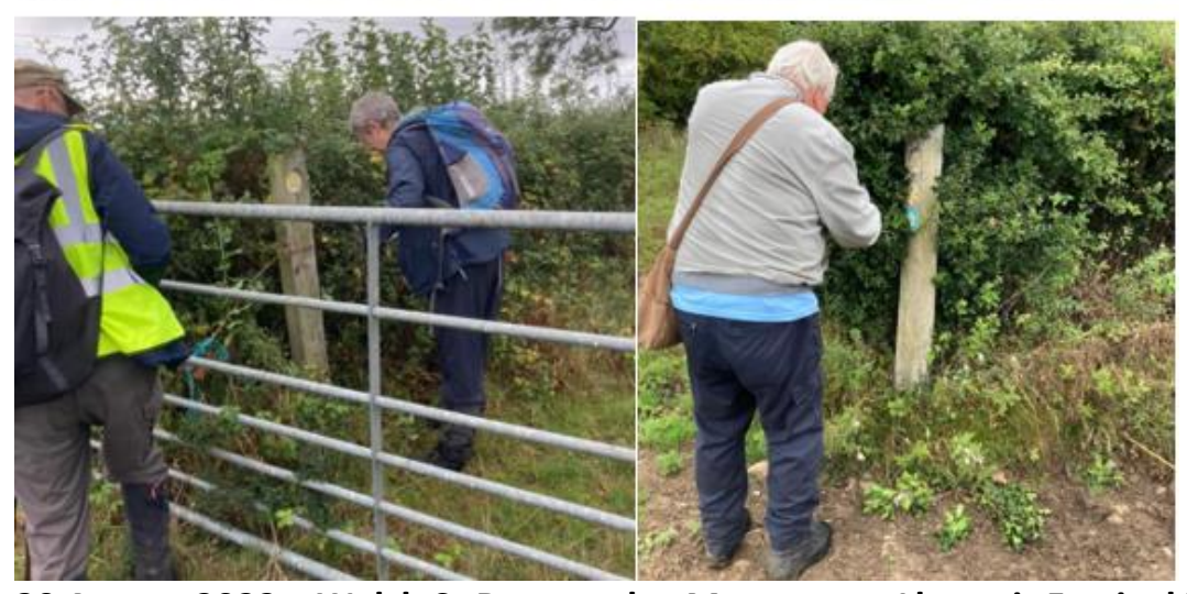
30 August 2022 – Welsh St Donats plus Marcross to Llantwit Festival Walk