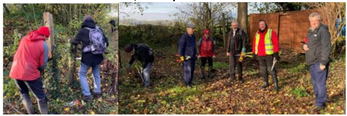
Well done, everyone! Now to the Pub? 😊