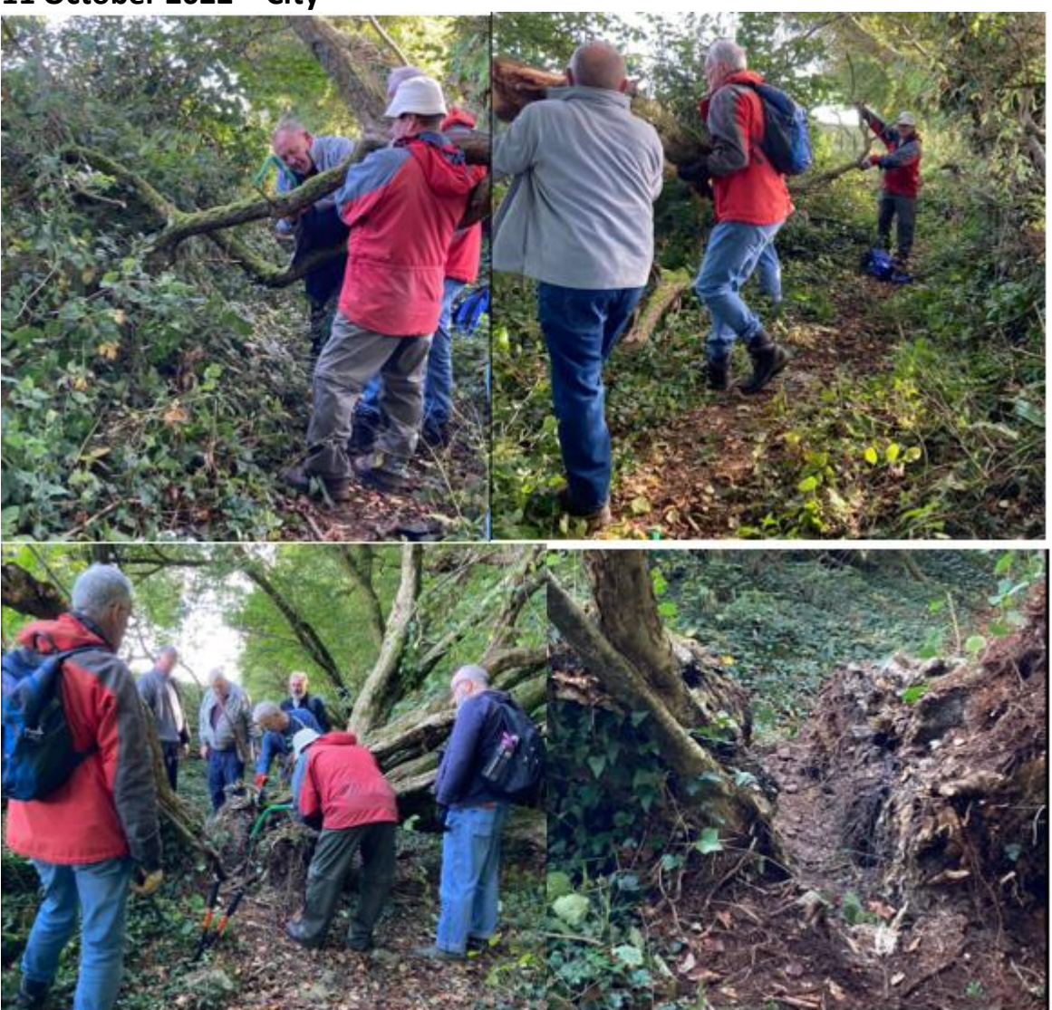
As always - great work keeping RoW open!