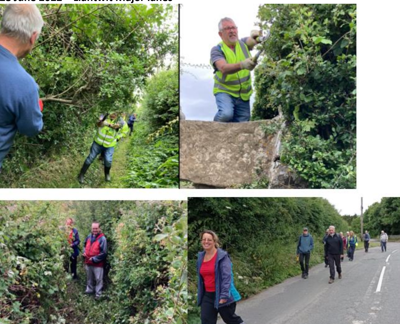
Thanks everyone, we live near the pond and have several more options for our daily walk now! Many thanks u guys make walking a pleasure