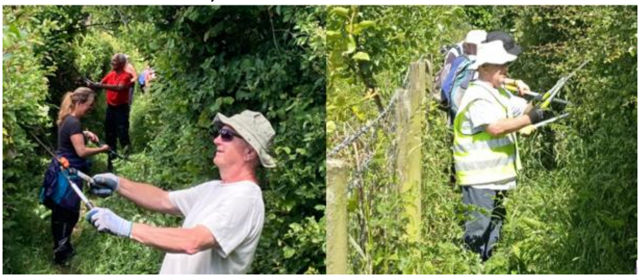
21 June 2022 - Coed Mynydd Coch - Woods West of Bonvilston