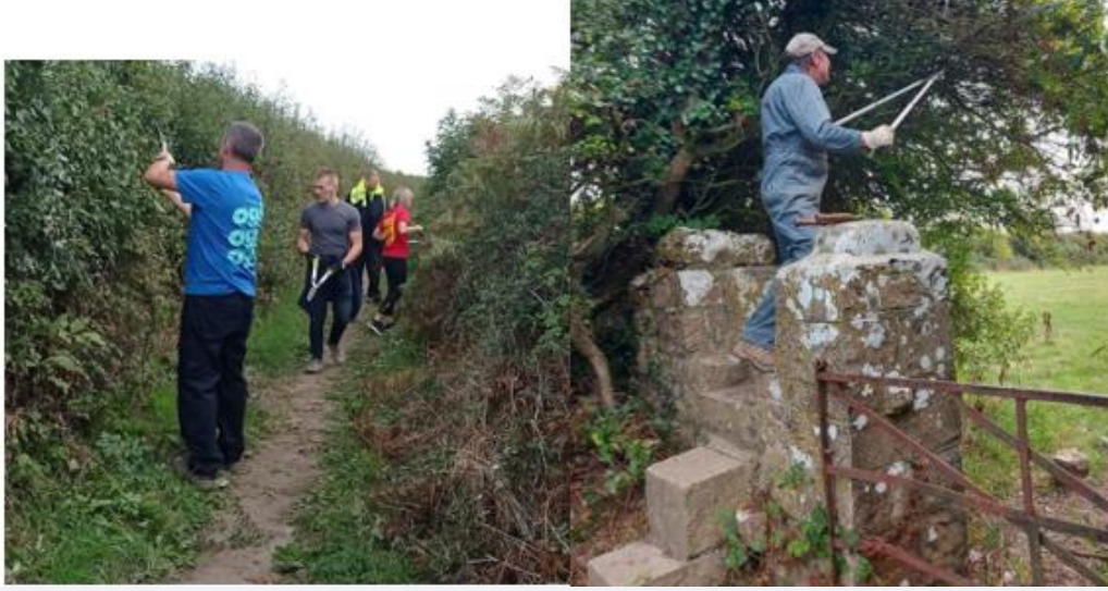
Many thanks.... was walking that route as usual today when you guys were in action.