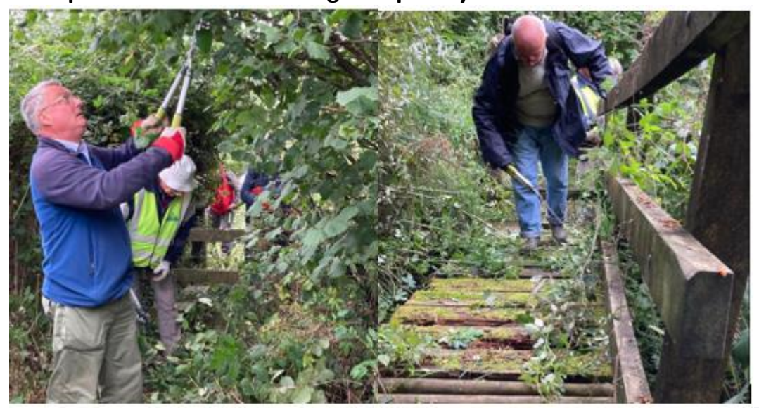
Many thanks, certainly everything grown since the Cardiff Conservation Volunteers helped to clear the bridle way.