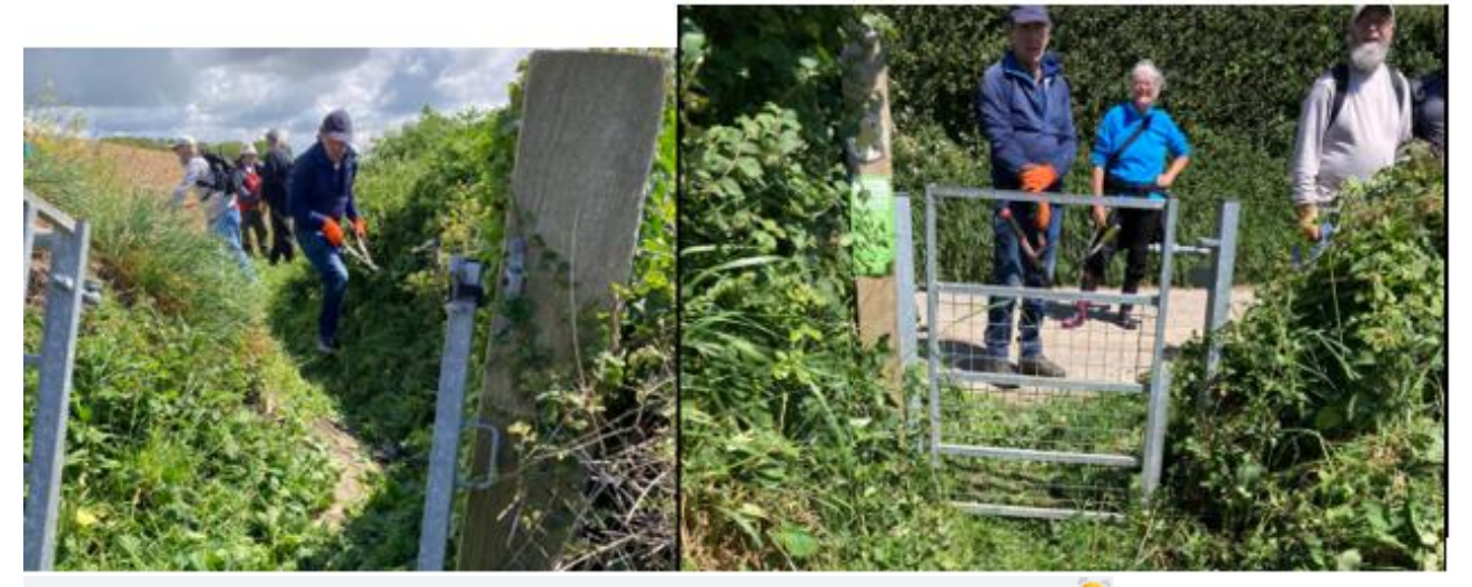
'A good job jobbed'.....as my Granny used to say. Well done everyone. 🌕